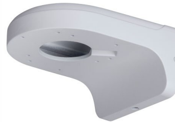
CP-UA-B06DW Wall Mount